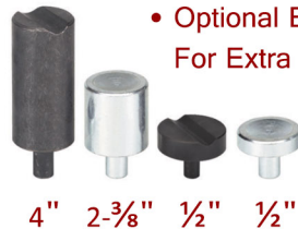
• Optional Extension Adapters For Extra Height