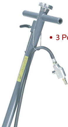
• 3 Position Locking T-handle