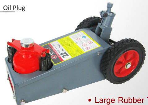
• Large Rubber Tires