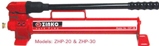
Models: ZHP-20 & ZHP-30