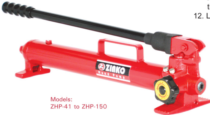
Models: ZHP-41 to ZHP-150