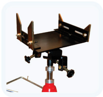
ZML Tilting Saddle