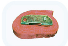
Safety Constraint Belt